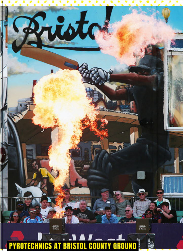
CRICKET GOES LATE INTO THE NIGHT