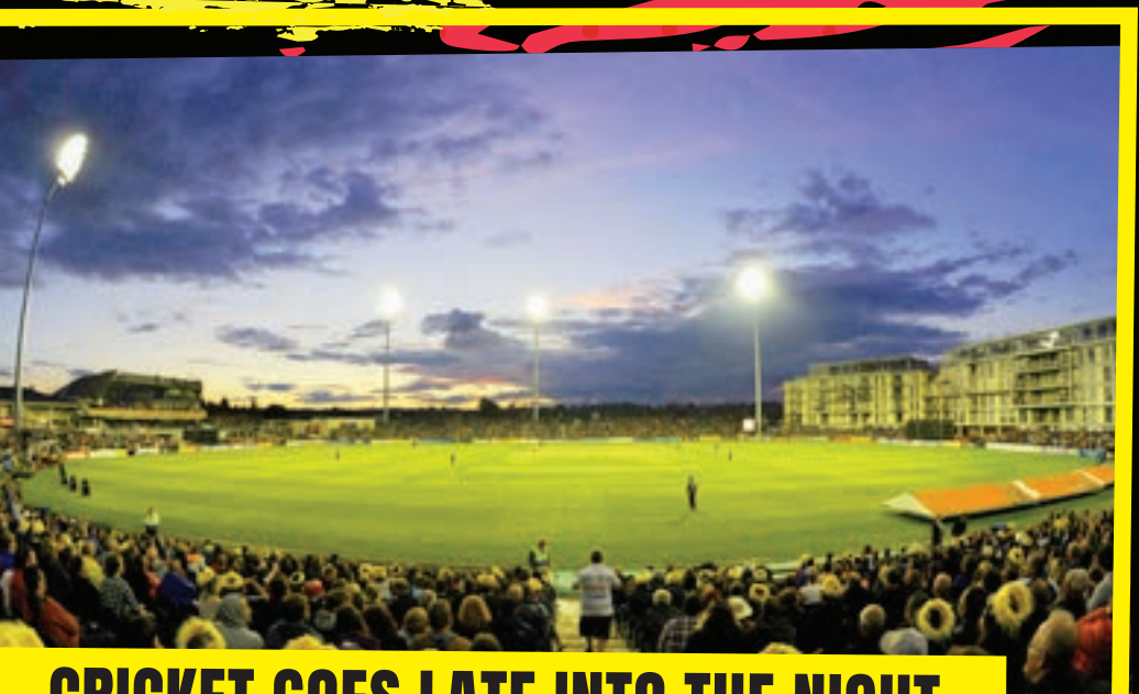
CRICKET GOES LATE INTO THE NIGHT