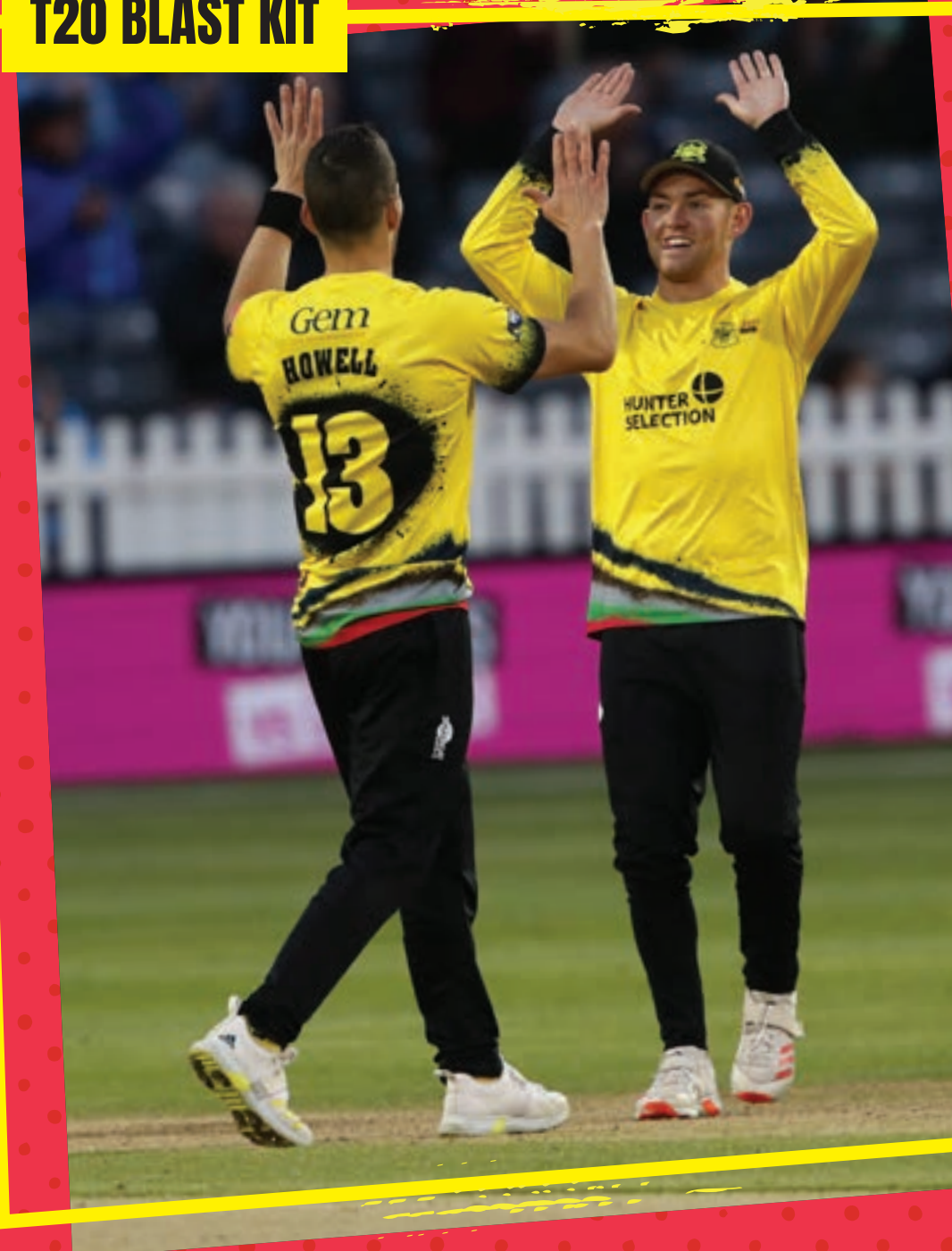
T20 BLAST KIT